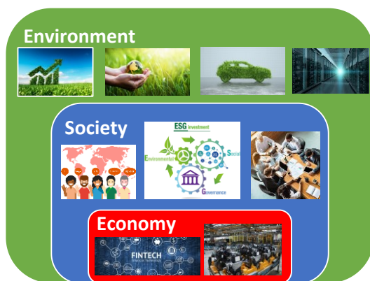
Figure 2: Sustainable Graph-Massivizer use cases, constraining economy and society by environmental limits.

Graph-Massivizer selects four real-world use cases with complementary economic, social, and environmental sustainability profiles, depicted in Figure 2. They must tackle complementary extreme data processing and MG analytics challenges, going in order of magnitude beyond big data in at least three “V” characteristics. Graph-Massivizer proposes a novel characteristic called “Viridescence”, representing the sustainability of processing extreme data from an environmental perspective. Table 1 summarizes seven characteristics enhanced through Graph-Massivizer from “big-to-extreme” dimensions and their balanced distribution across the four use cases.